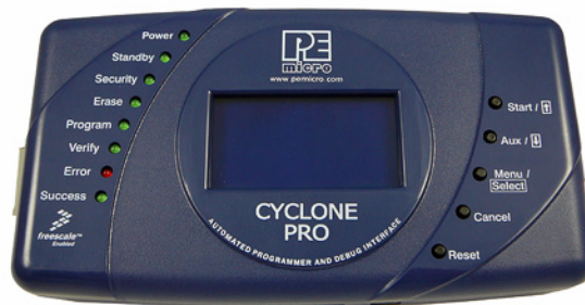
P&E's Cyclone PRO

The USB BDM MULTILINK is intended for development and is not designed to accommodate the demands of production programming. However, P&E's Cyclone programmers are specifically engineered to withstand the rigors of a production environment and will provide a seamless transition from the USB BDM MULTILINK. More information is available at: http://www.pemicro.com/cyclone